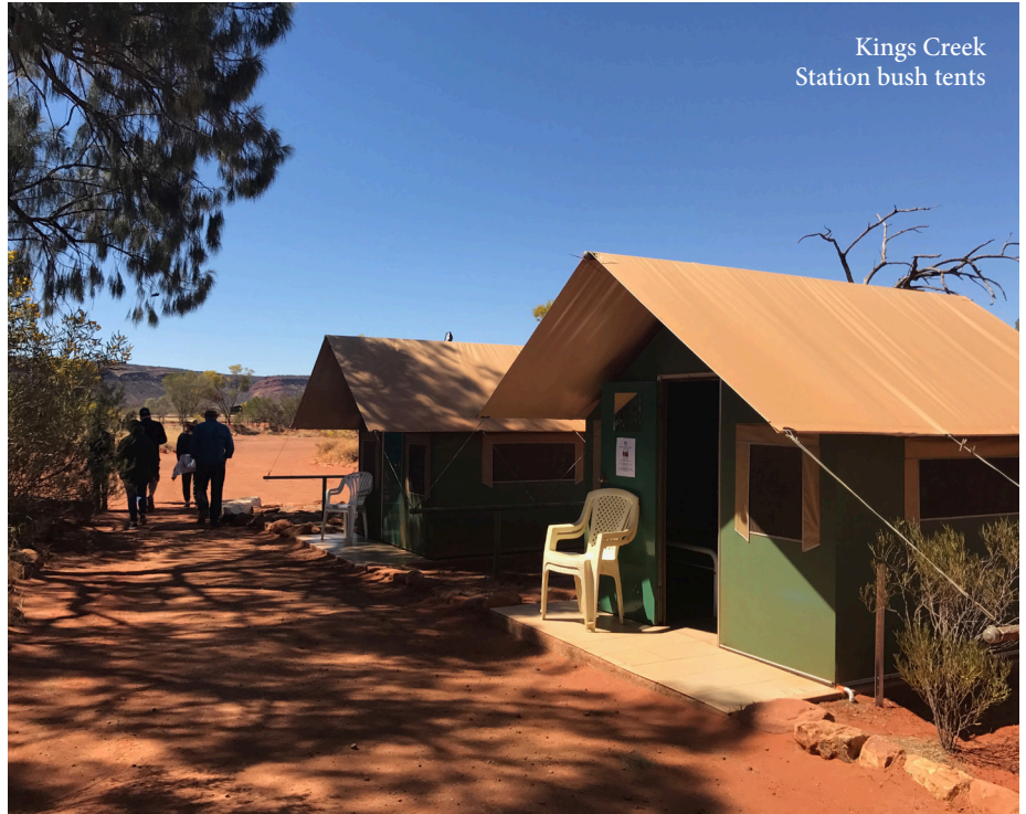
Kings Creek Station bush tents

In the mid afternoon depart the hotel with your guide to visit Kata Tjuta.