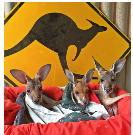
Joeys and Kangaroo sign

ALL RESPONSES WILL BE MADE IN ACCORDANCE WITH BEST PRACTICE MEDICAL AND OFFICIAL GOVERNMENT ADVICE.