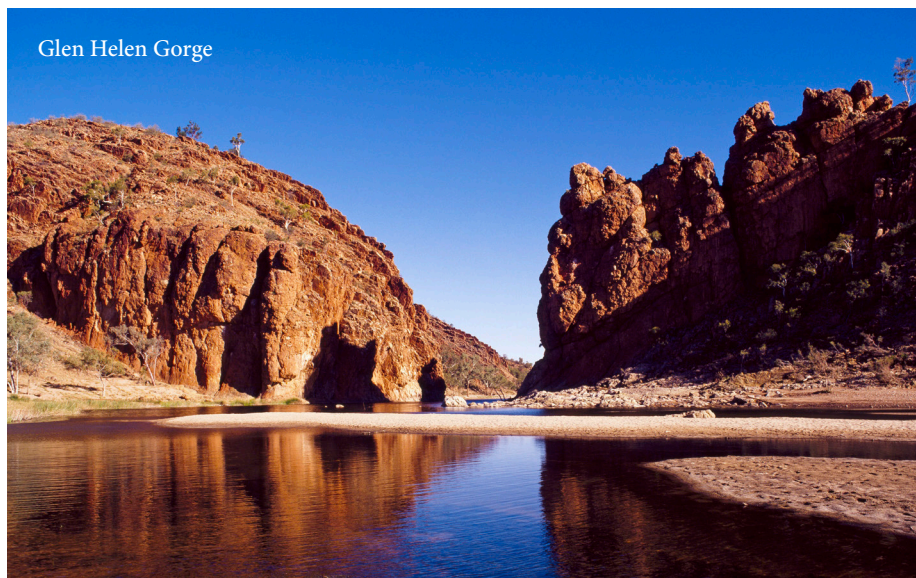
Glen Helen Gorge

△ Accommodation: Glen Helen Lodge ○ Breakfast, lunch and dinner provided