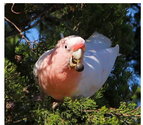
Pink cockatoo feeding

On this trip You will be helping nature while you enjoy it. This is Conservation Travel.