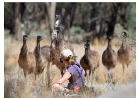
Male emu with his chicks

Extend your trip – we are happy to help!