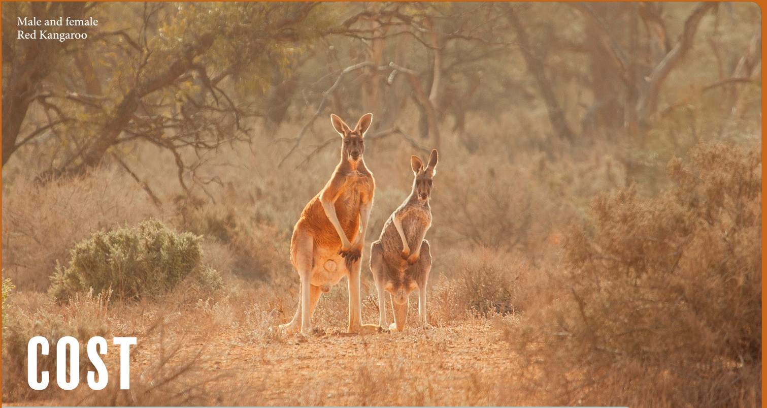
Male and female Red Kangaroo