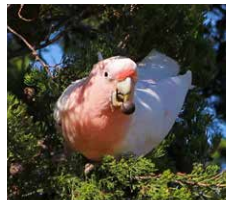
Pink cockatoo feeding

On this trip You will be helping nature while you enjoy it. This is Conservation Travel.