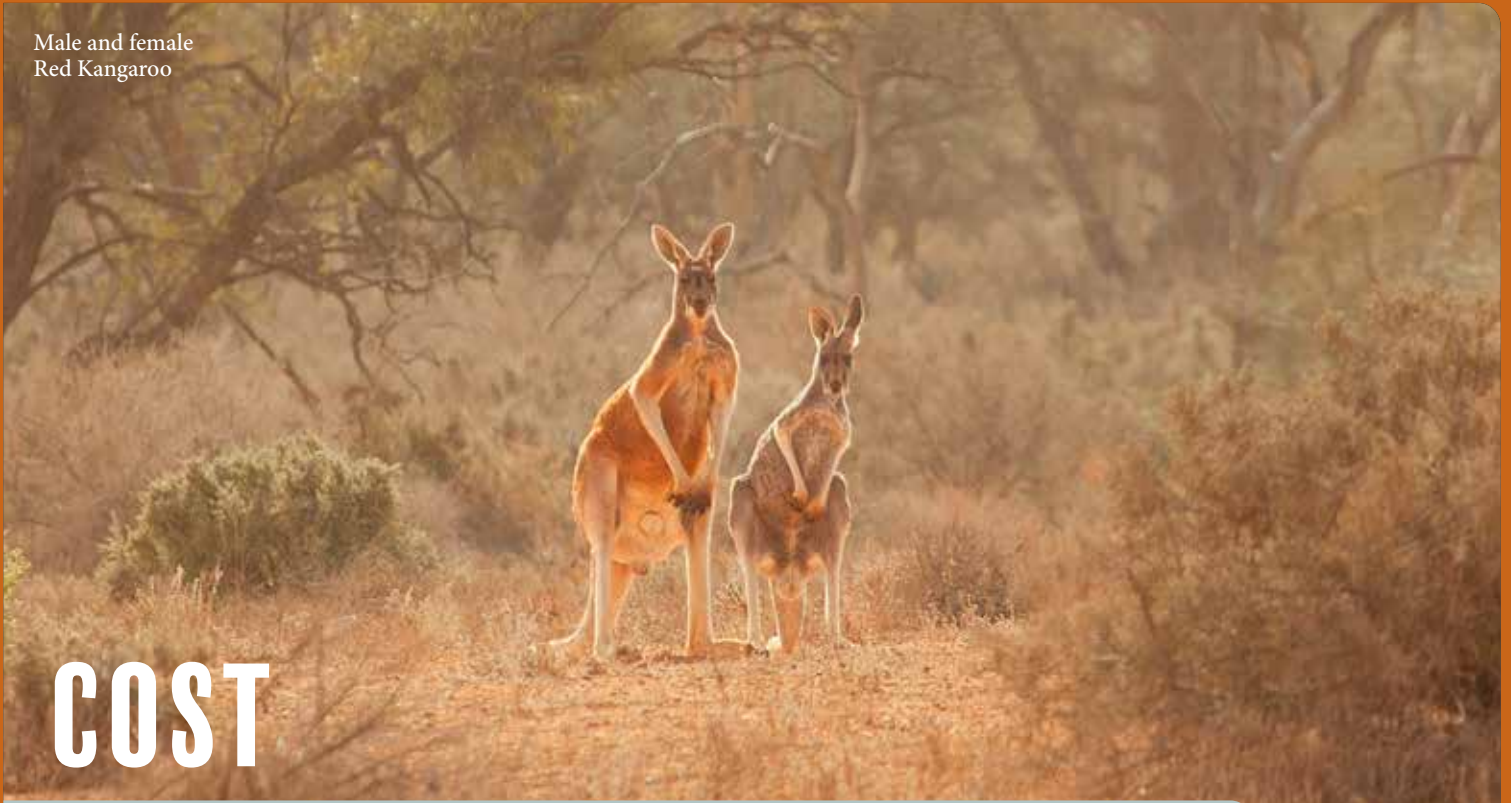
Male and female Red Kangaroo