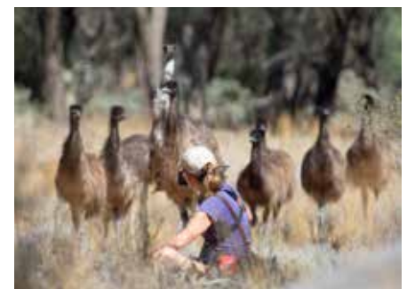
Male emu with his chicks

Extend your trip – we are happy to help!