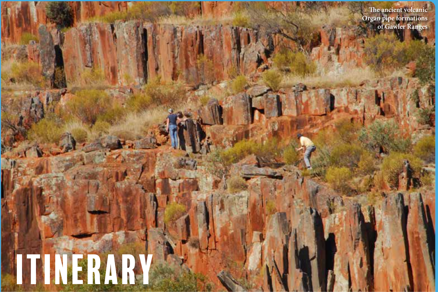
The ancient volcanic Organ pipe formations of Gawler Ranges