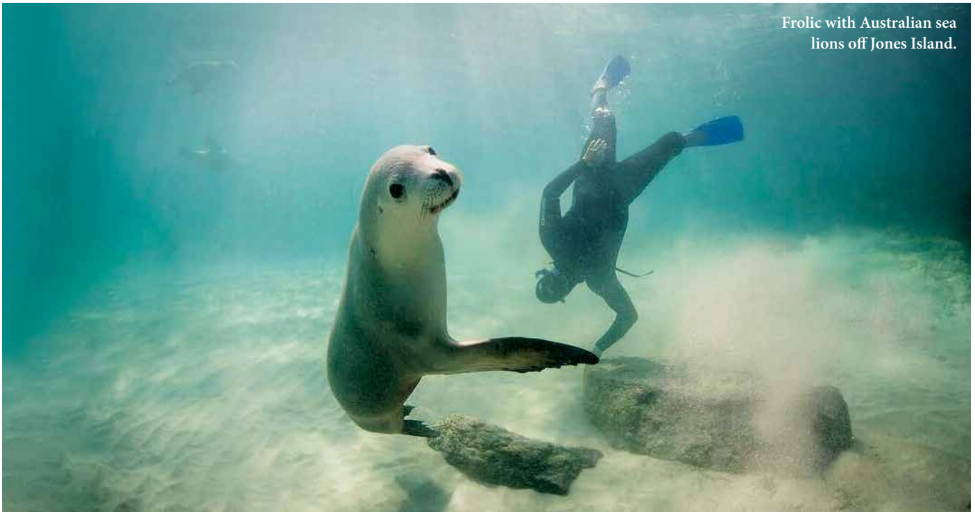
Frolic with Australian sea lions off Jones Island.