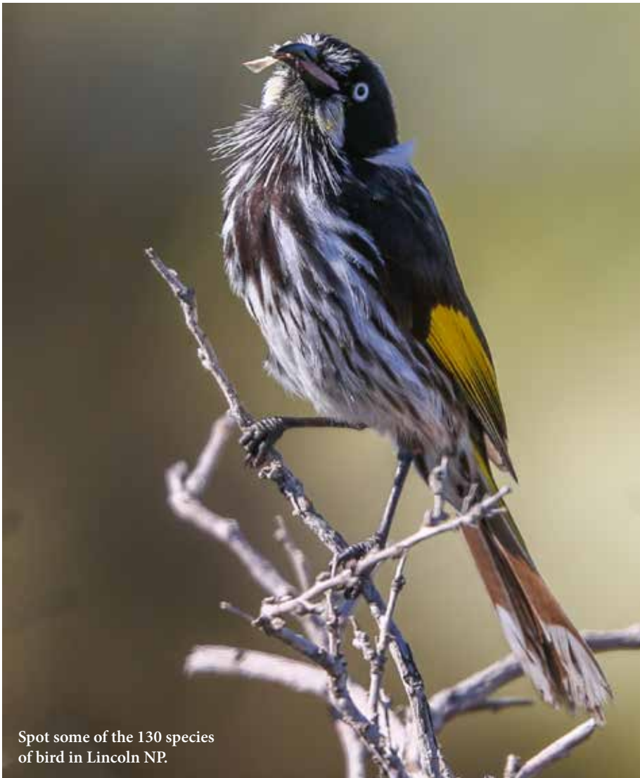
Spot some of the 130 species of bird in Lincoln NP.