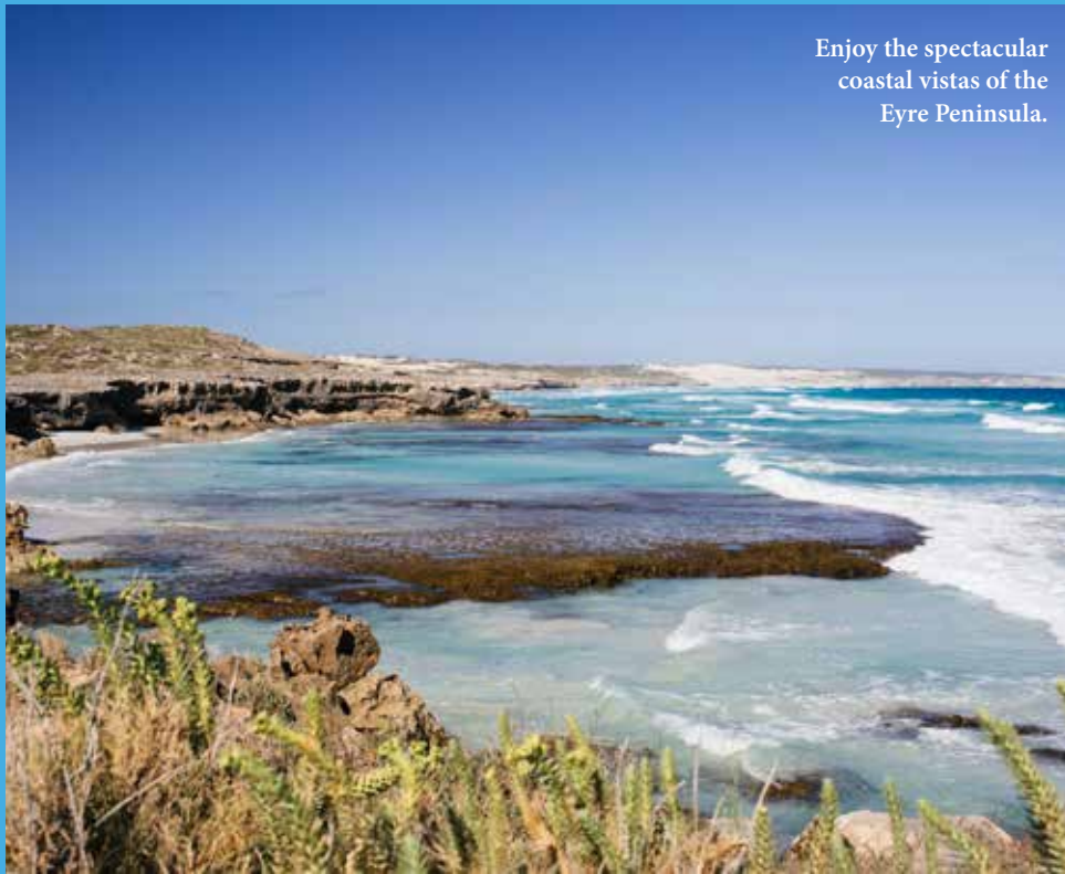
Enjoy the spectacular coastal vistas of the Eyre Peninsula.