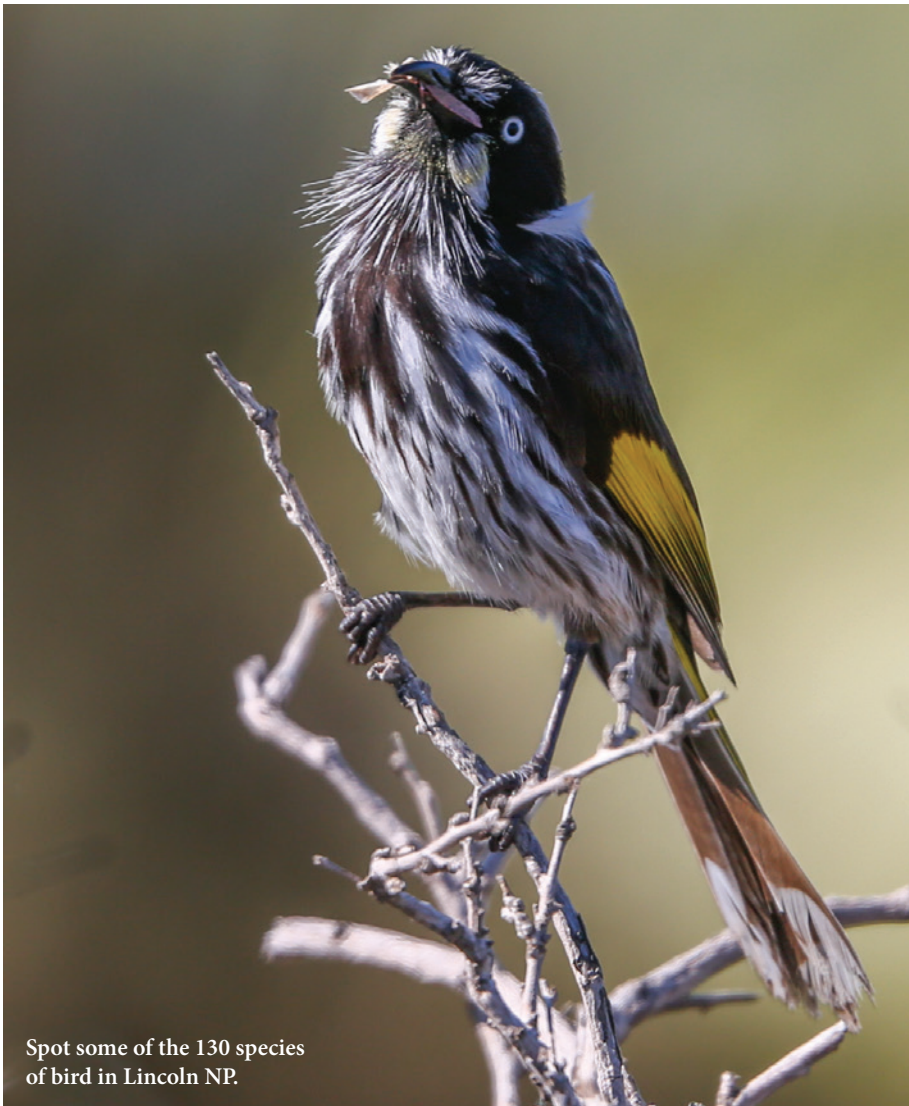
Spot some of the 130 species of bird in Lincoln NP.