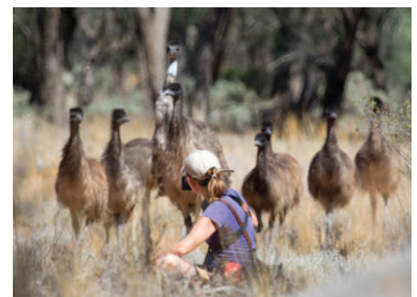
Male emu with his chicks

Extend your trip – we are happy to help!