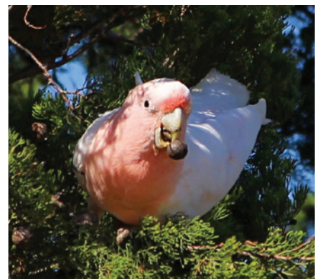
Pink cockatoo feeding

On this trip You will be helping nature while you enjoy it. This is Conservation Travel.