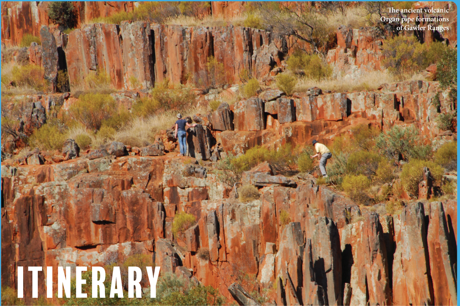
The ancient volcanic Organ pipe formations of Gawler Ranges