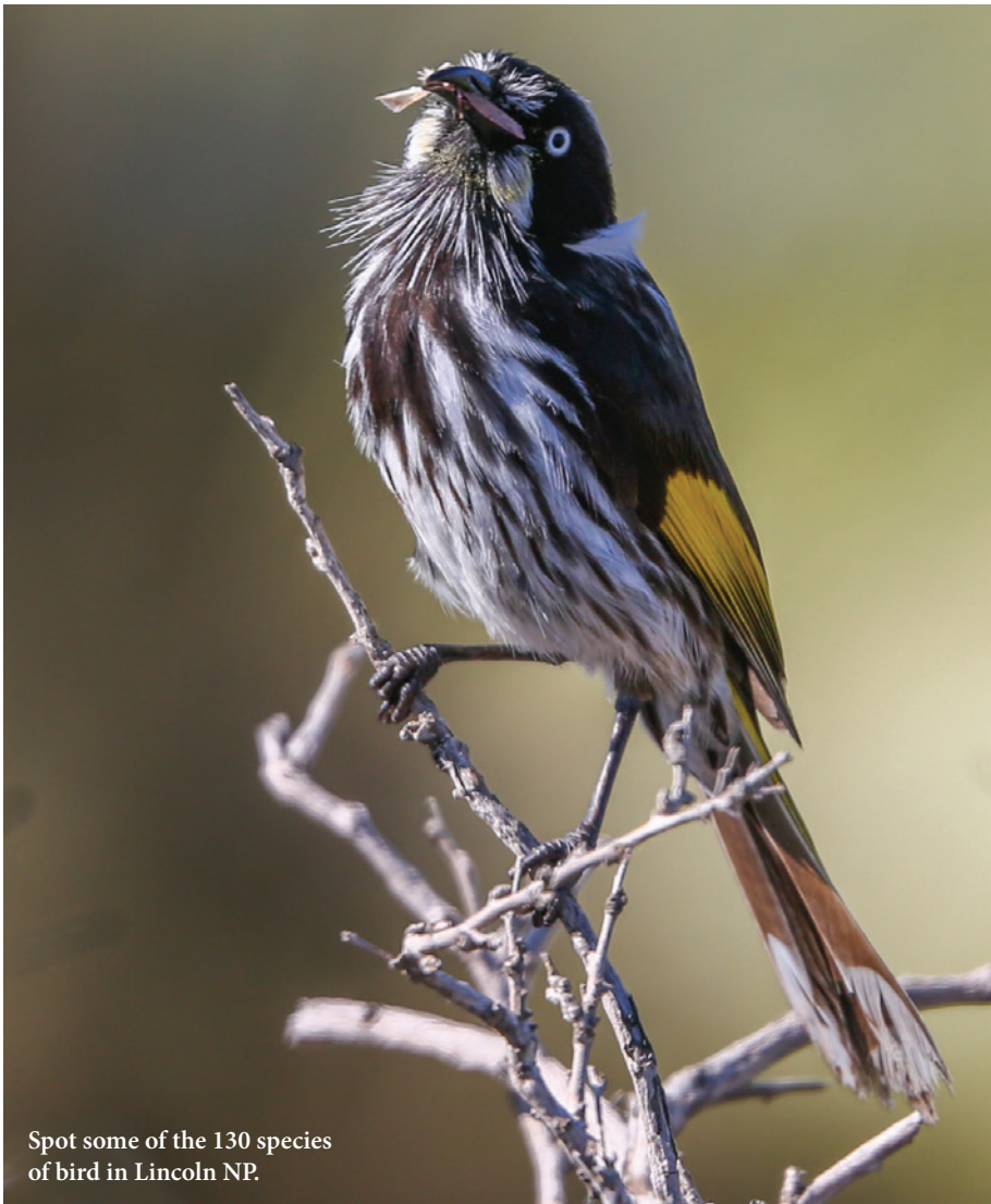
Spot some of the 130 species of bird in Lincoln NP.

birds and reptiles. By using citizen scientists to help us monitor these species we greatly increase our survey capability both spatially and over time. There are 130 species of birds listed in the national park as well as many western grey kangaroos, emus and lizards.