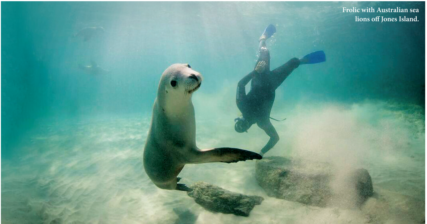
Frolic with Australian sea lions off Jones Island.