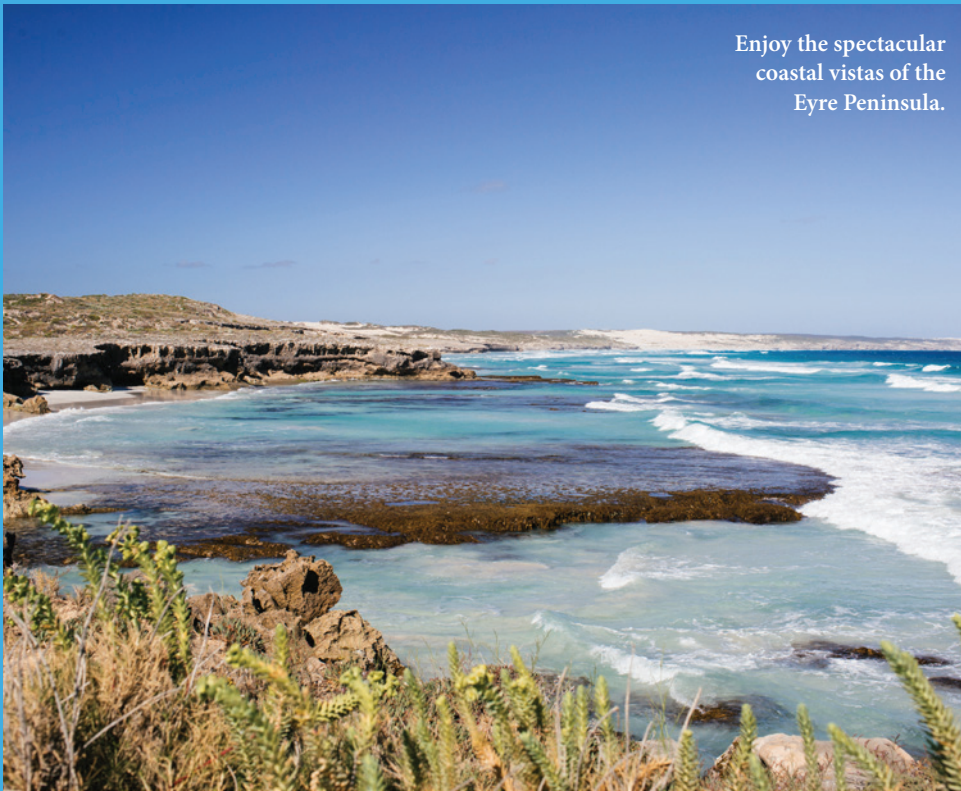
Enjoy the spectacular coastal vistas of the Eyre Peninsula.

iting the area are truly spectacular. Further along is Cape Wiles, named after the botanist James Wiles who sailed with Flinders in 1802. Dozens of fur seals splash around the base of the two golden sandstone islands just off the point, protected on one side from the harshness of the Southern Ocean.