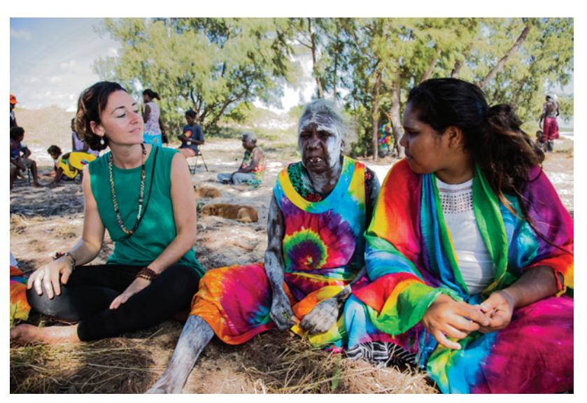
Please refer to further information to our Terms & Conditions.

For the health and safety of all passengers and staff on tour, any illness (such as fever, coughing or difficulty breathing) will not be accepted onboard any IAT touring unless they can provide us with a negative COVID-19 test result received within the past 72 hours. Should any passenger start to feel unwell on arrival or while on tour, they must immediately advise the tour manager and contact a medical practitioner / medical centre / hospital. To return to the tour the passenger must be deemed fit and well to participate fully on the tour, obtaining and providing IAT with a written medical clearance i.e. not just a negative COVID-19 test. Any costs incurred will be at the passenger's own expense.