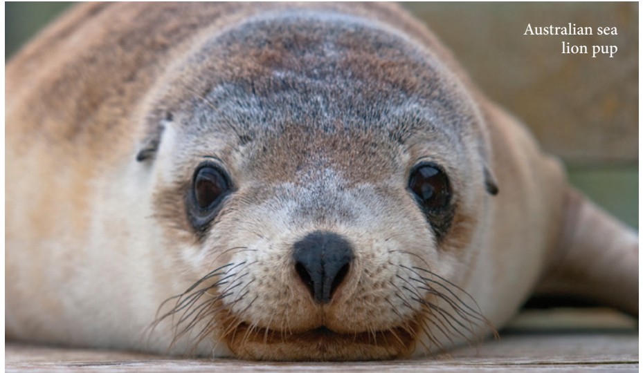
Australian sea lion pup