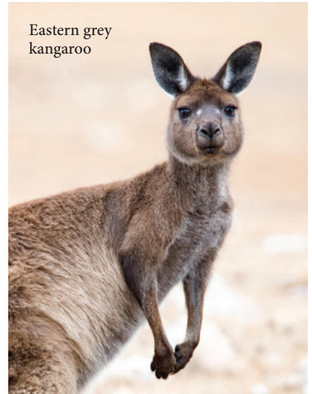
Eastern grey kangaroo

Take a stunning coastal hike along the clifftops of Cape Gantheaume Conservation Park.