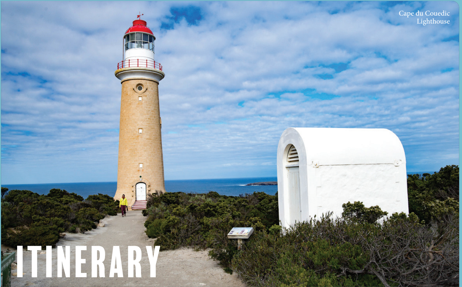
Cape du Couedic Lighthouse