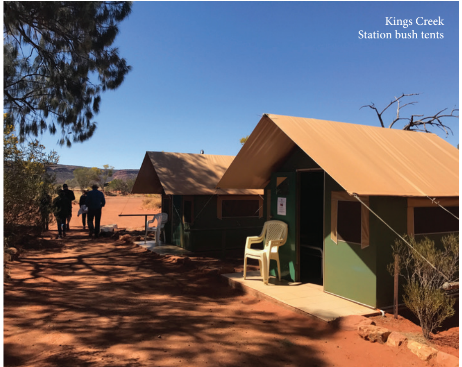
Kings Creek Station bush tents

In the mid afternoon depart the hotel with your guide to visit Kata Tjuta. Enjoy