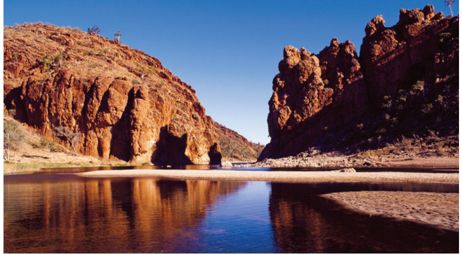
Glen Helen Gorge

At Glen Helen Gorge , the ranges part to make way for the Finke River. This permanent waterhole is an important refuge in the hot summer months, for all nine species of fish recorded for the Finke, as well as migrating waterbirds. From here the Finke River makes its way on to the Simpson Desert. The area's traditional owners believe that this inviting swimming spot is the home of an ancient and powerful Rainbow Serpent, and regard it as off limits.