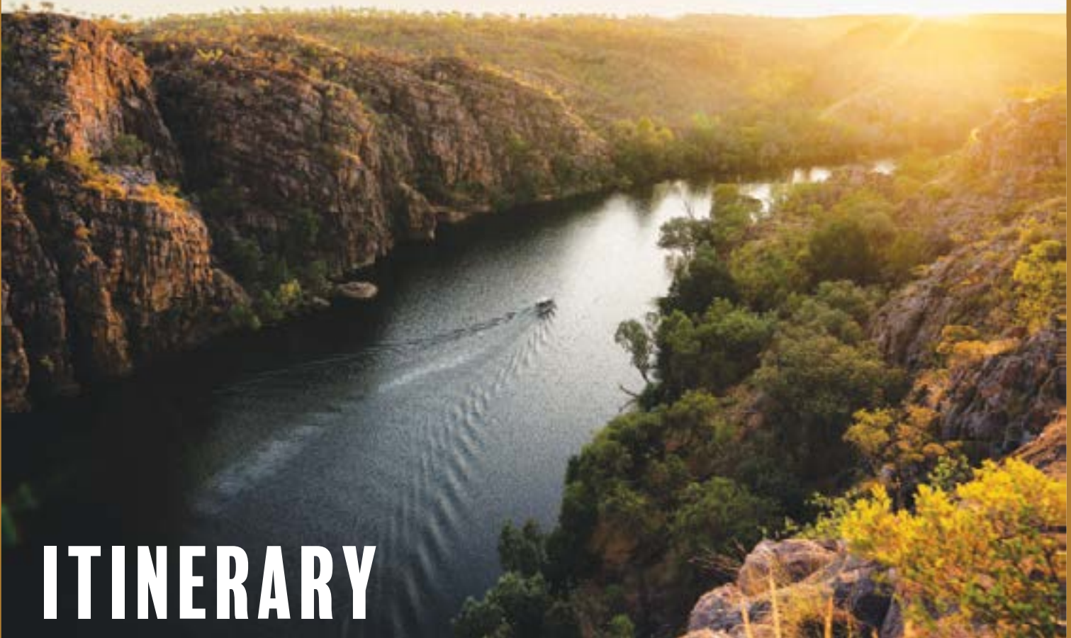
The spectacular view from Baruwei Lookout into Katherine Gorge.