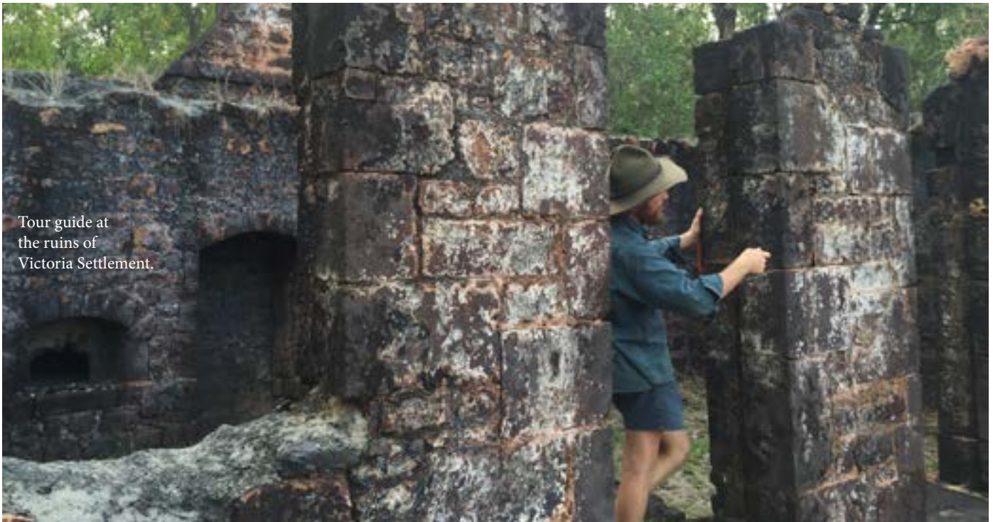
Tour guide at the ruins of Victoria Settlement.