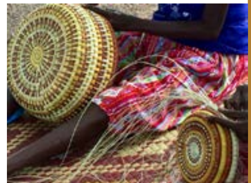
Local artists weaving traditional pandanus baskets.

△ Accomm: Wugularr (cabins) ○ Breakfast, lunch and dinner provided