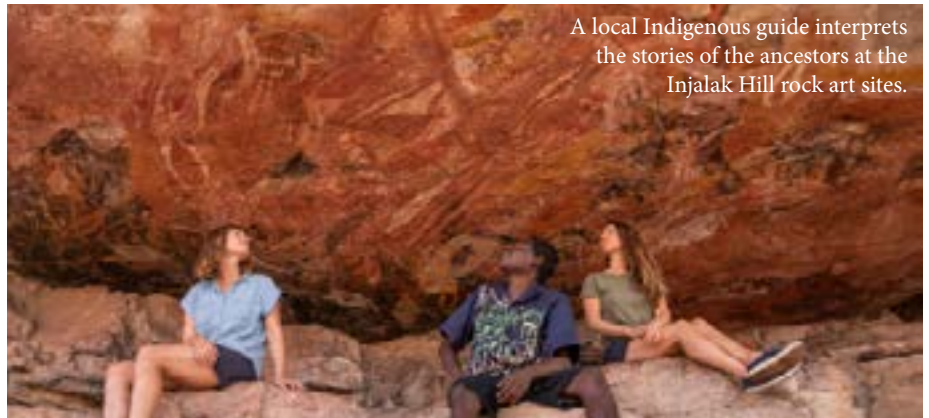
A local Indigenous guide interprets the stories of the ancestors at the Injalak Hill rock art sites.

At dawn, after a full breakfast at the lodge, we'll join a 2-hour sunrise cruise on the