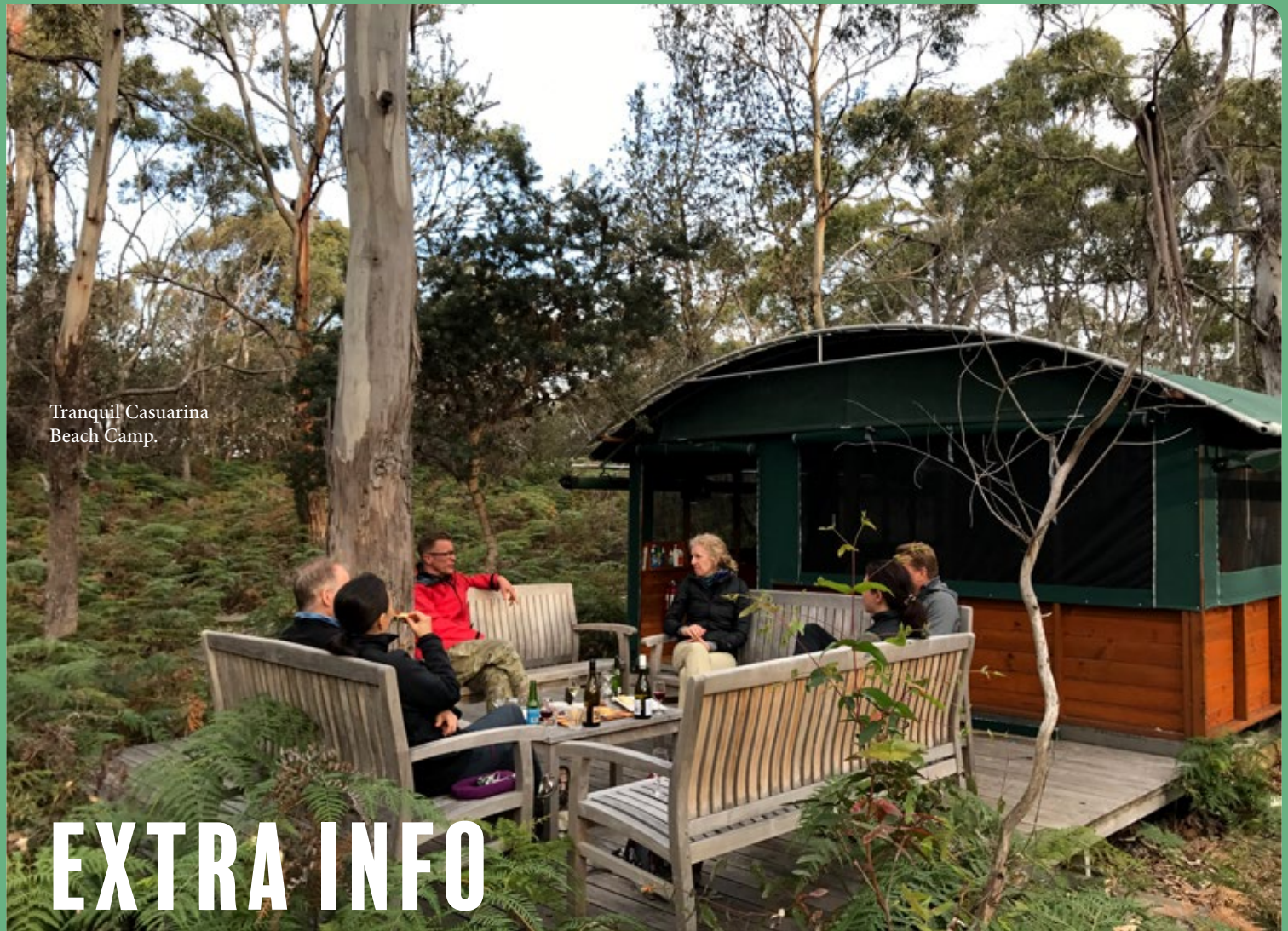
Tranquil Casuarina Beach Camp.