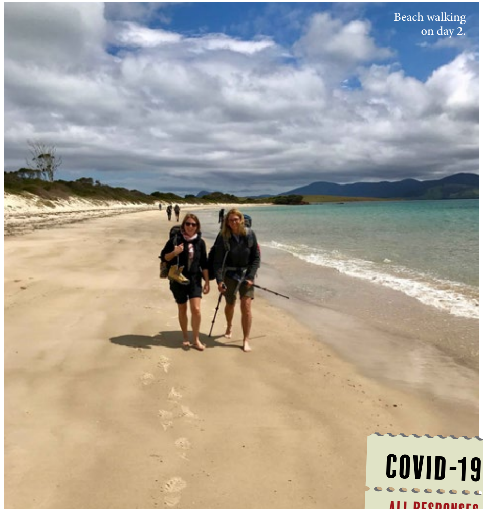
Beach walking on day 2.

△ Accommodation: On Maria Island: two nights in Wilderness Camps, one night at Bernacchi House